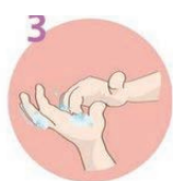
Rub tips of fingers