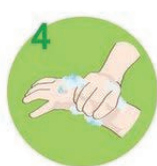
Rub each wrist