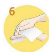
Dry your hands