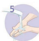
Rinse your hands