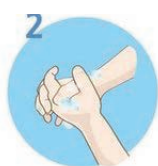
Rub palm to palm with fingers