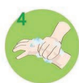
Rub each wrist