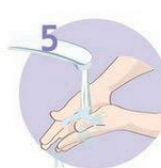
Rinse your hands